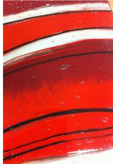
Close-up of fused glass triptych

Several images of the triptych have been collected on Enigma's Flickr page.