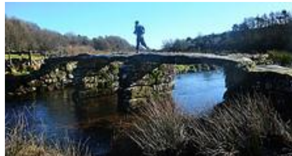
Rory Smith running across a clapper bridge at Postbridge, Dartmoor

"The South Devon Half Marathon is renowned for its challenging course which features beautiful landscapes but severe changes in terrain and topography."