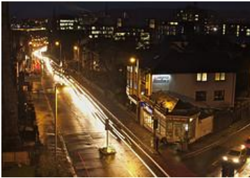
Nightscape of Enigma's offices with views towards the University of Plymouth and the city centre